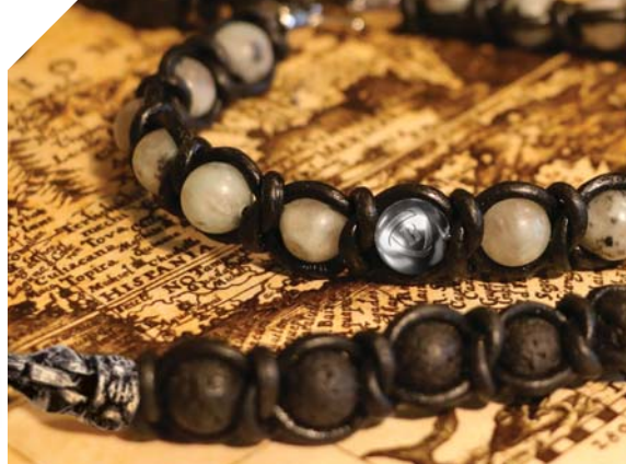
Brigade's signature stainless steel bead proclaims to the world that you're ready to conquer life's challenges in a style that's uniquely you.